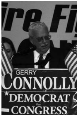
Chairman Gerry Connolly

The primary voters of the 11th congressional district gave Gerry Connolly a resounding validation of his record of good local government and getting things done, and set the stage to send Gerry to do the same with the federal government in November. Gerry addressed the hundreds of celebrating supporters on election night and promised that "Mark Warner and I have a lot of work to do in Congress, and we will deliver!"